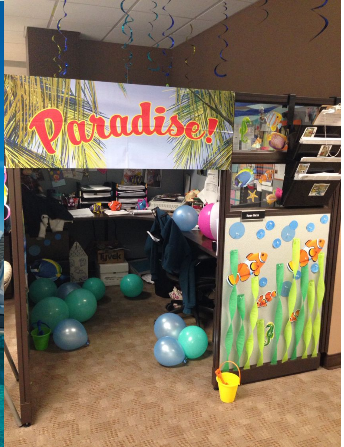
A travel agency without agency... There are many references to destination spots and dream spaces; the conference room is the opposite of that.