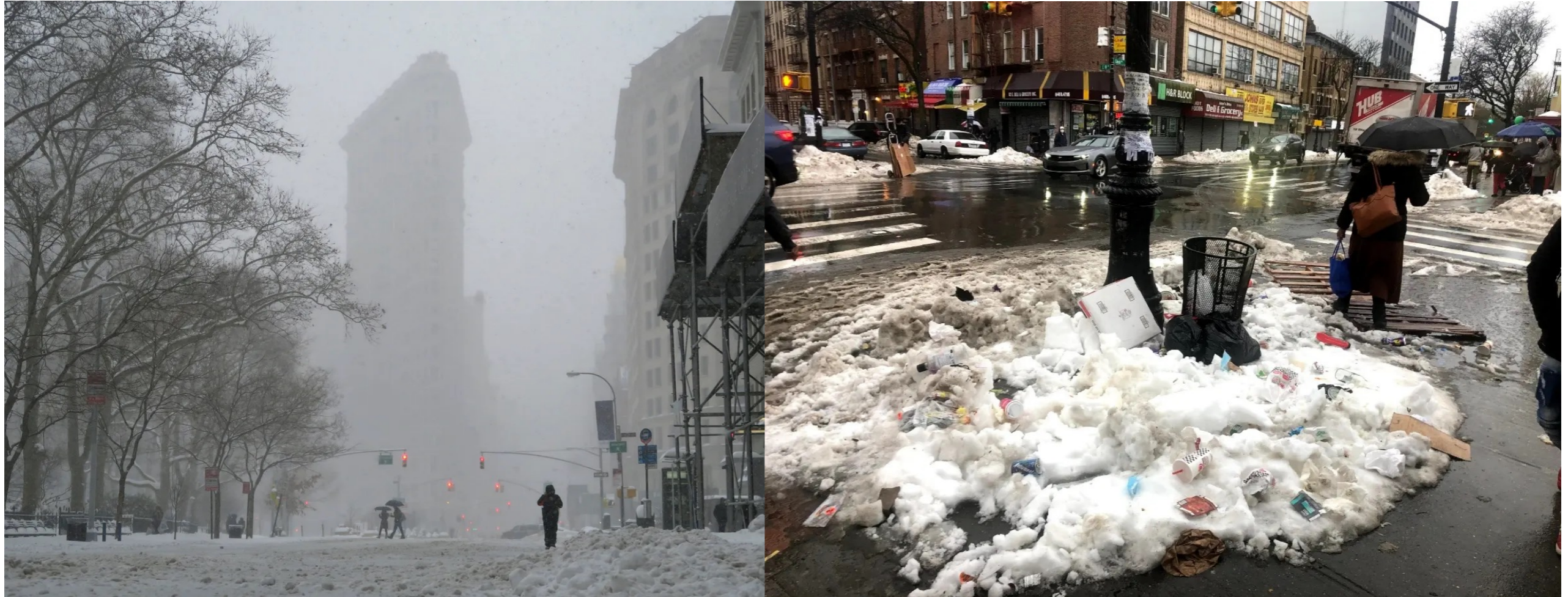
This is a bit of the physical reality outside of the office walls.