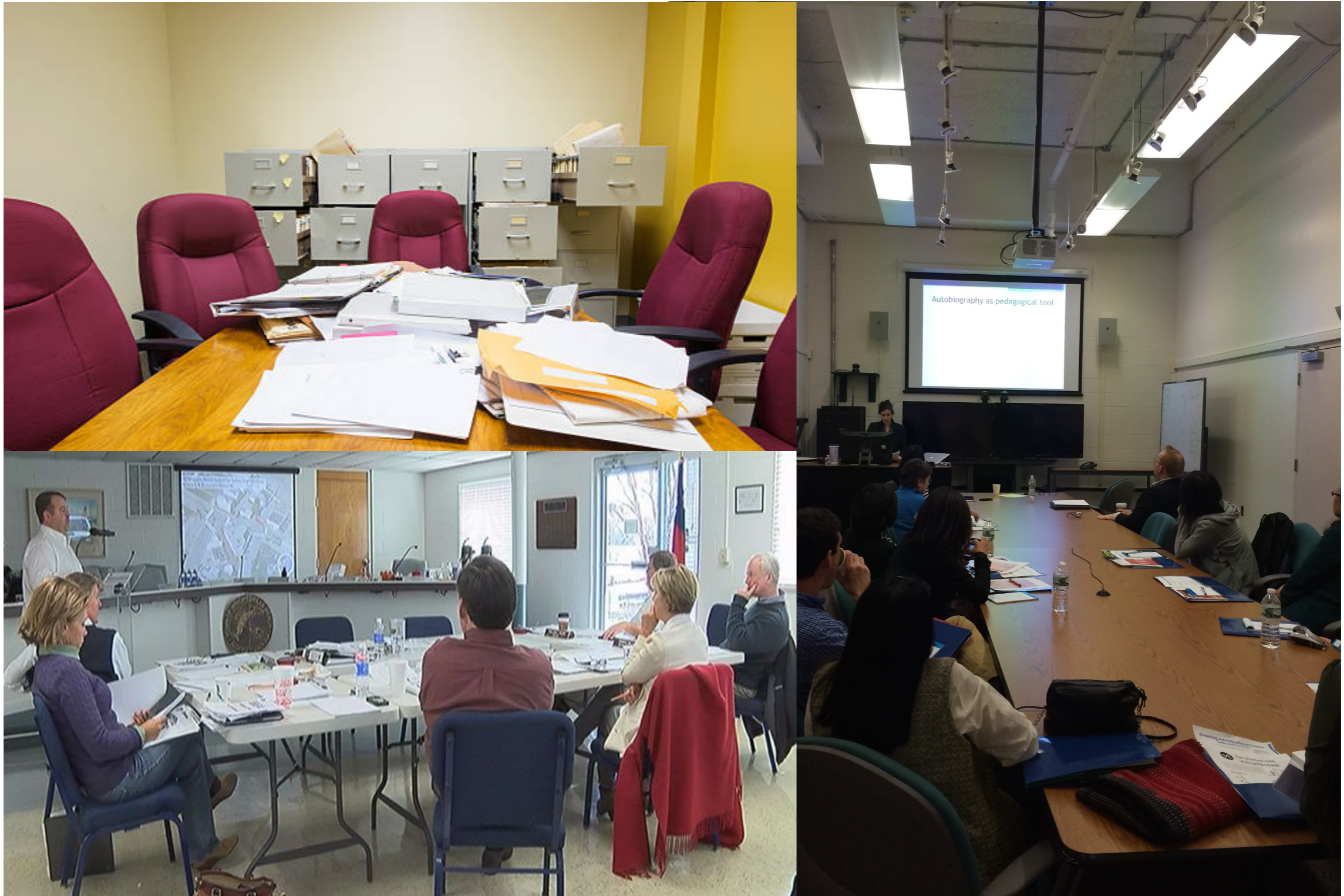
A variety of crowded conference rooms. A mix of folding chairs around our conference table will suggest that the company really is making ends meet. I like the depth of the narrow room, and the lights that accentuate its direction.