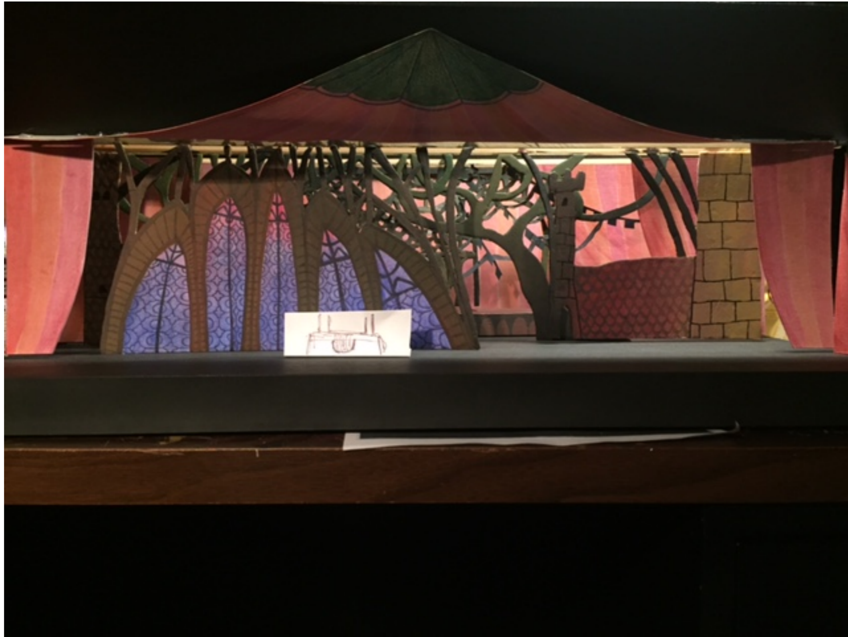
CHAPEL AT ARLES - p.42 Morning Glow

Chapel flies in, altar is placed, Cityscape in, Tree drop in, Tent in, Palace portal in, all tent drops in