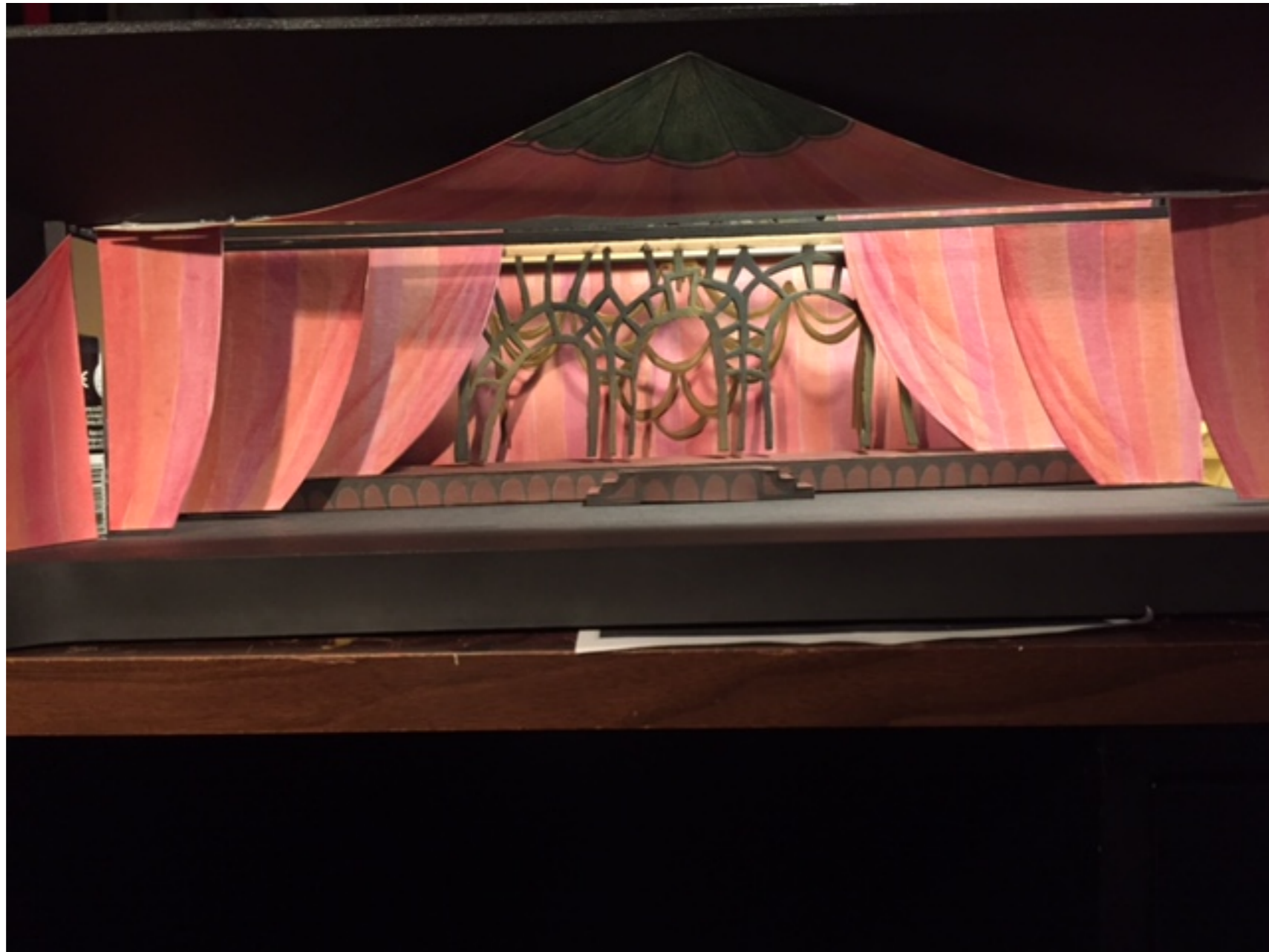
CHARLEMAGNE'S PALACE - p.7 Welcome Home

Leading Player pulls ribbon out of floor, the ribbon rises from behind the platform as the palace portal flies in in front of it, all tent drops in