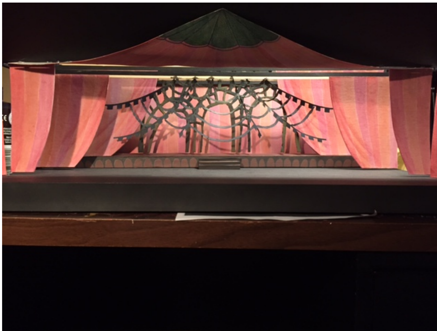
CHARLEMAGNE'S TENT - p.18 War Is A Science

Staircase is folded in, Tent is flown in, pinned up by actors, Palace portal in, all tent drops in