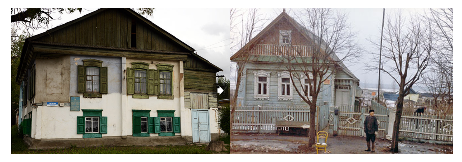
I am interested in the style of these windows as well.