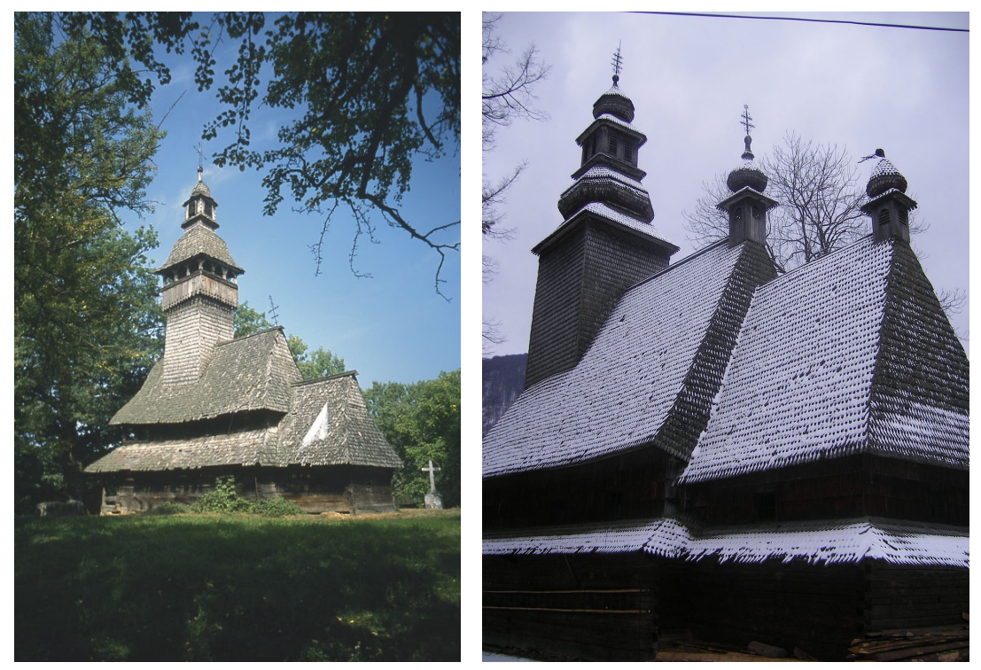
Here I am drawn to the grade of the rooftops, and like the vast amount of space they take up in comparison to the wall structure.