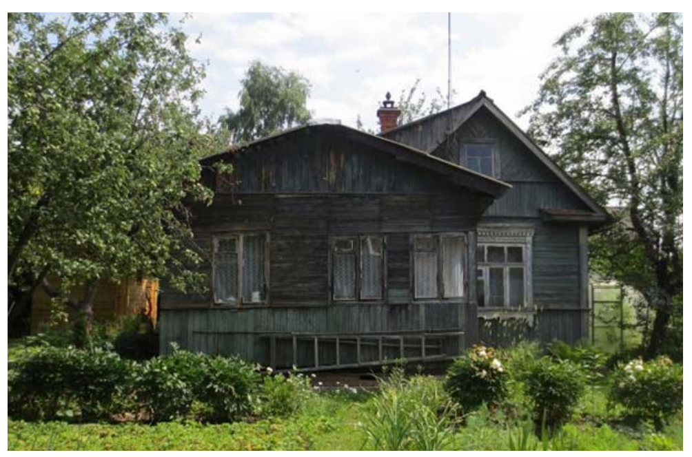
I like the age of this building, and am particularly interested in the white windowpane on the right.